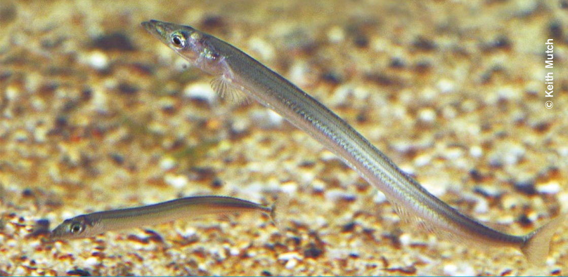
Sandeels above a sandy seabed.