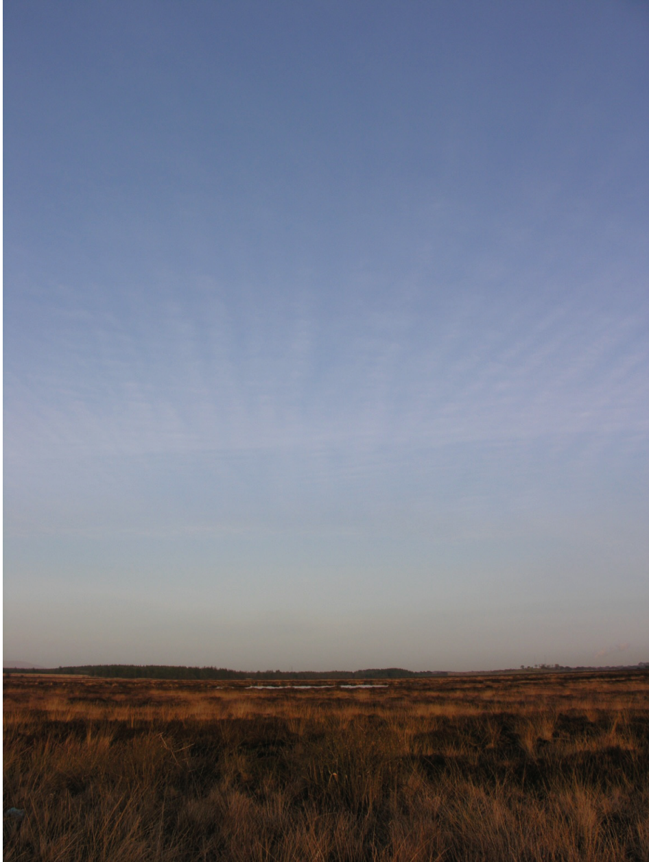
Frontispiece, View over the pools at Fannyside Muir

This photograph, (which deliberately incorporates a large amount of sky to convey a sense of wild, open space), provides an indication of the nature of the roost site at Fannyside Muir. This part of the muir is characterised by pools within a wide open expanse of raised bog covered by heathery vegetation, with distant views to stunted and planted coniferous trees. It is considered that this is of significance as the area looks and 'feels' very similar to taiga, the habitat with which taiga bean geese, ( Anser fabalis fabalis ), is associated with on its breeding grounds in boreal latitudes of Scandinavia and Russia.