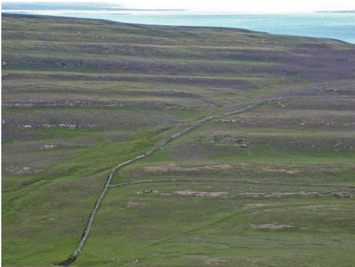
Figure 1. View of terracing on Faraclett Head

Terracing features are evident on many hill slopes.