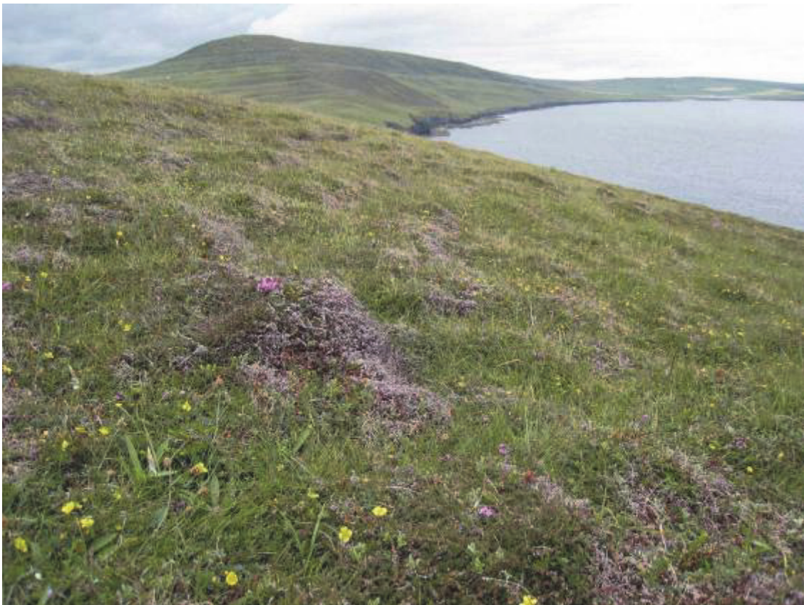
Figure 4. Herb-rich H10d heath in foreground. View from Faraclett Head to Kierfea Hill.

For the community as a whole over 100 species were recorded.