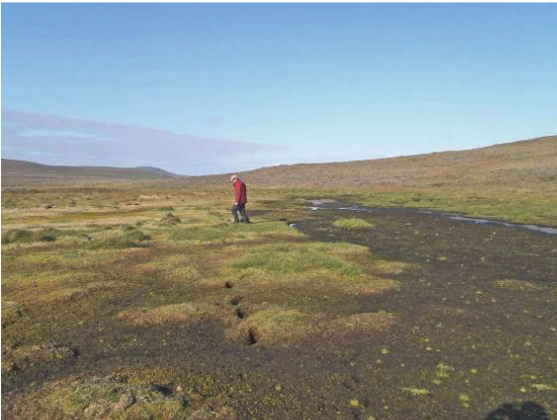
Figure 5. Flanders Moss. M1 bog-pool community well developed

Floristics: This species-poor community is typically dominated by a lawn of Sphagnum . Here Sphagnum cuspidatum is the main species but Sphagnum denticulatum is not uncommon. There is also occasional to frequent Sphagnum capillifolium and Sphagnum papillosum but these species seldom contribute much to cover. With respect to vascular plants only Eriophorum angustifolium is frequent throughout but there is occasional to frequent Drosera rotundifolia and Narthecium ossifragum .