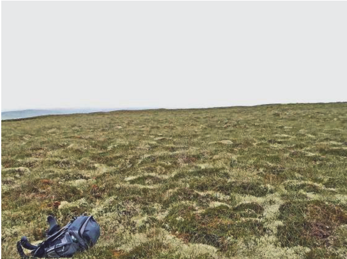
Figure 8. View along plateau of Blotchnie Fiold. Here lichen-rich M19b blanket bog is similar to montane forms of M19c.

It should be noted that erosion features such as peat hags are not uncommon along the main ridge of the Blotchnie Fiold and the ridges of Twelve Hours Tower and Withamo (see Figure 9).