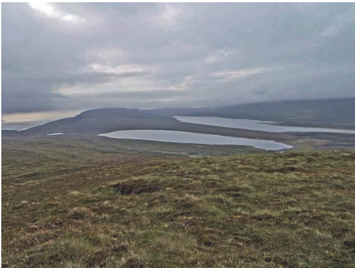
Figure 2. View of Peerie Water and Muckle Water from Blotchnie Fiold. Peatland is extensive in this area and in particular blanket bog.

Good examples of terracing include the SW slopes of Blotchnie Fiold and Ward Hill, the north and east slopes of Kierfea Hill and nearly all of Faraclett Head. This terracing gives rise to a variety of environmental conditions and vegetation communities in close proximity, arranged in more or less horizontal bands. The upper edges of steep terrace slopes may have rock outcrops or very thin peat/mineral soil covering. The soils here are usually rich and give rise to calcareous grassland and heath. On the terraces themselves base-rich irrigation continues, producing flushed wet heath and herb and sedge-rich Molinia grassland. The effect of underlying calcareous rock is most apparent at Faraclett, where much of the dry and wet heath excepting maritime forms is calcareous. Elsewhere on wider terraces peat accumulation is evident and locally blanket bog has developed (see Figure 2).