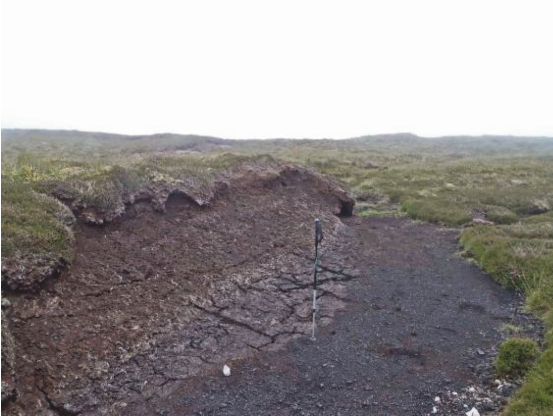
Figure 9. Peat Hags. Not uncommon over plateau of Blotchnie Fiold