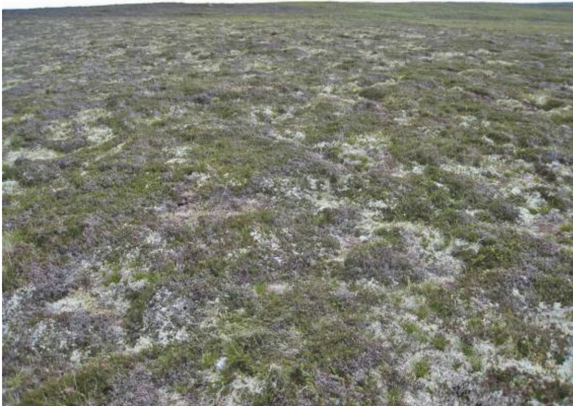
Figure 7. View of Cladonia -rich M15c wet heath. Superficially this vegetation type closely resembles H10b.

The Vaccinium myrtillus sub-community (M15d) is somewhat peculiar as Vaccinium myrtillus itself is sparse or absent from this wet heath type. Nevertheless, the differentials Anthoxanthum odoratum , Hypnum jutlandicum , Juncus squarrosus and Nardus stricta are all frequent and there is occasional to frequent Festuca ovina agg., Luzula multiflora and Rhytidiadelphus loreus . Among the companion species Empetrum nigrum and Hylocomium splendens are frequent.