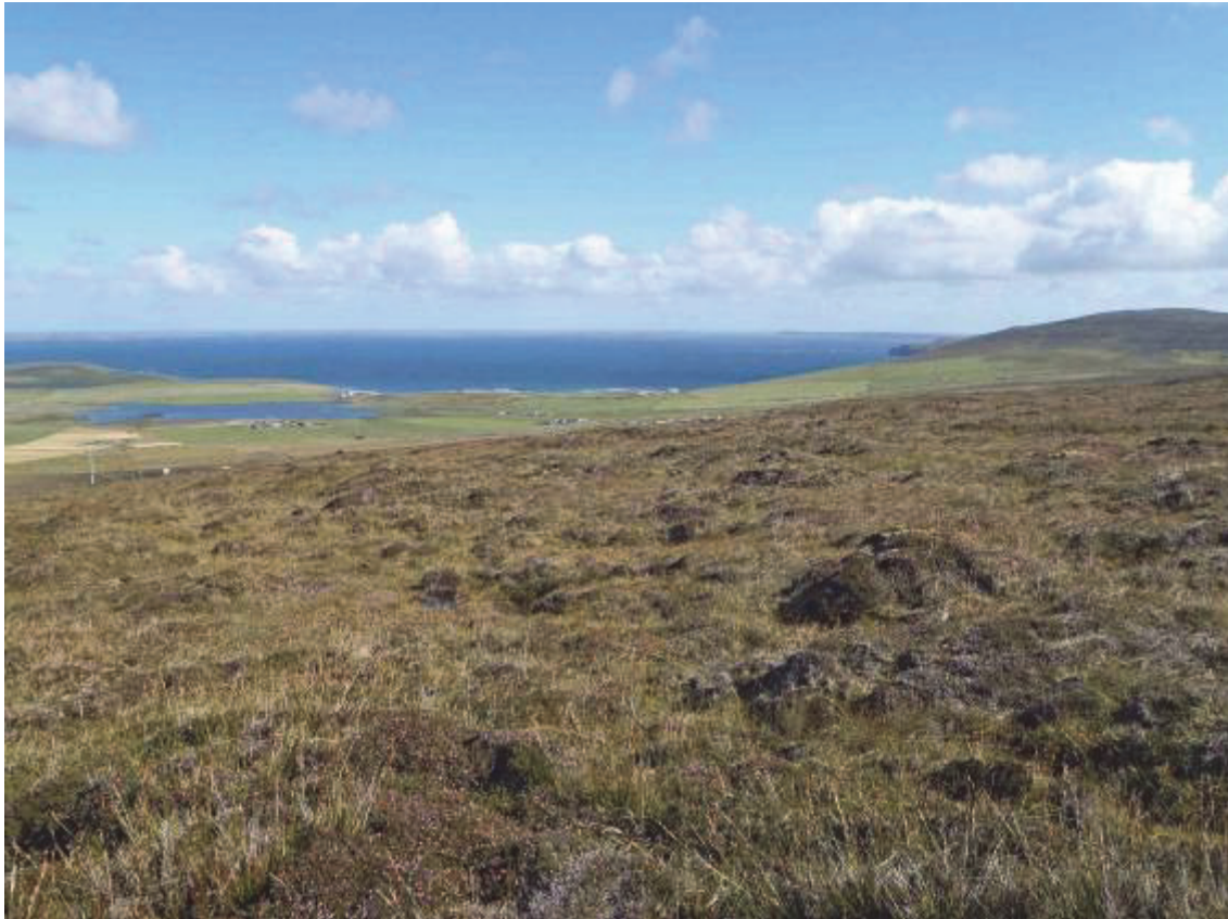
Figure 6. View from Nether Bow looking northward and eastward to Kierfea. Wet heath (M15b) well developed in foreground.

Floristics: Three of the five key constants are frequent throughout. They are Calluna vulgaris , Molinia caerulea and Potentilla erecta and of these Calluna is usually the most abundant species. Erica tetralix is frequent in M15a and M15ai but only occasional to frequent in all the other types. Trichophorum germanicum is notably frequent in M15c but is only occasional in M15b and M15d. It is rather scarce in M15a.