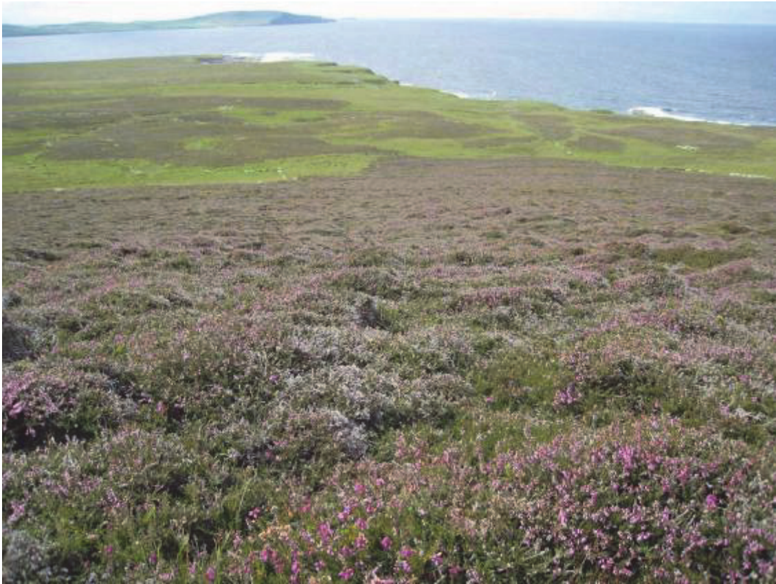
Figure 3. Quendal: H10a heath abundant in foreground.

With an average of about 11 species per quadrat the Empetrum nigrum variant (H10ai) is also species-poor but more diverse than H10a. As the name suggests this variant contains abundant Empetrum nigrum . However the cover of this dwarf shrub rarely exceeds 25%. Anthoxanthum odoratum , Luzula multiflora and Nardus stricta are frequent and there is occasional to frequent Festuca ovina and Hypnum jutlandicum . This type of heathland represents a transition to maritime forms of dry heath (H7d).