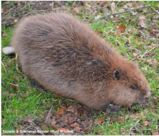
Tayside & Grampian Beaver

Write whatever comes to mind. Choose up to 5 words, phrases or drawings.