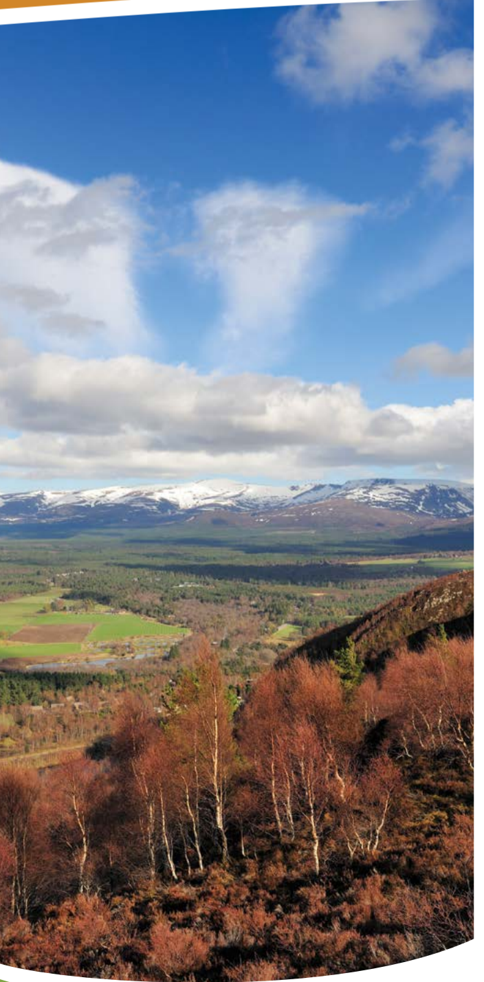
View from Craigellachie towards Cairngorms

Photos by: Lorne Gill/SNH and Laurie Campbell. Main map by Ashworth Maps. All map data © Crown copyright 2011. Ordnance Survey. Licence number: 100017908 © Scottish Natural Heritage 2015. ISBN: 978-1-85397745-9. Print Code: M/G200615