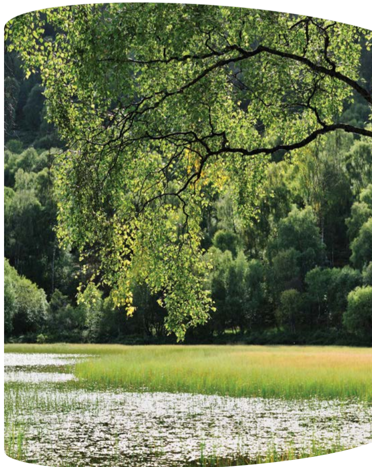
View across old reservoir

Also look out for a sign giving details about an audio guide to the Reserve that you can access via your mobile phone.