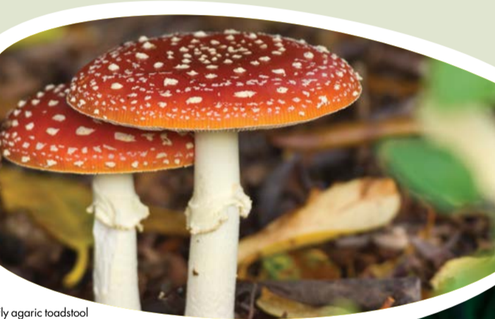
Fly agaric toadstool