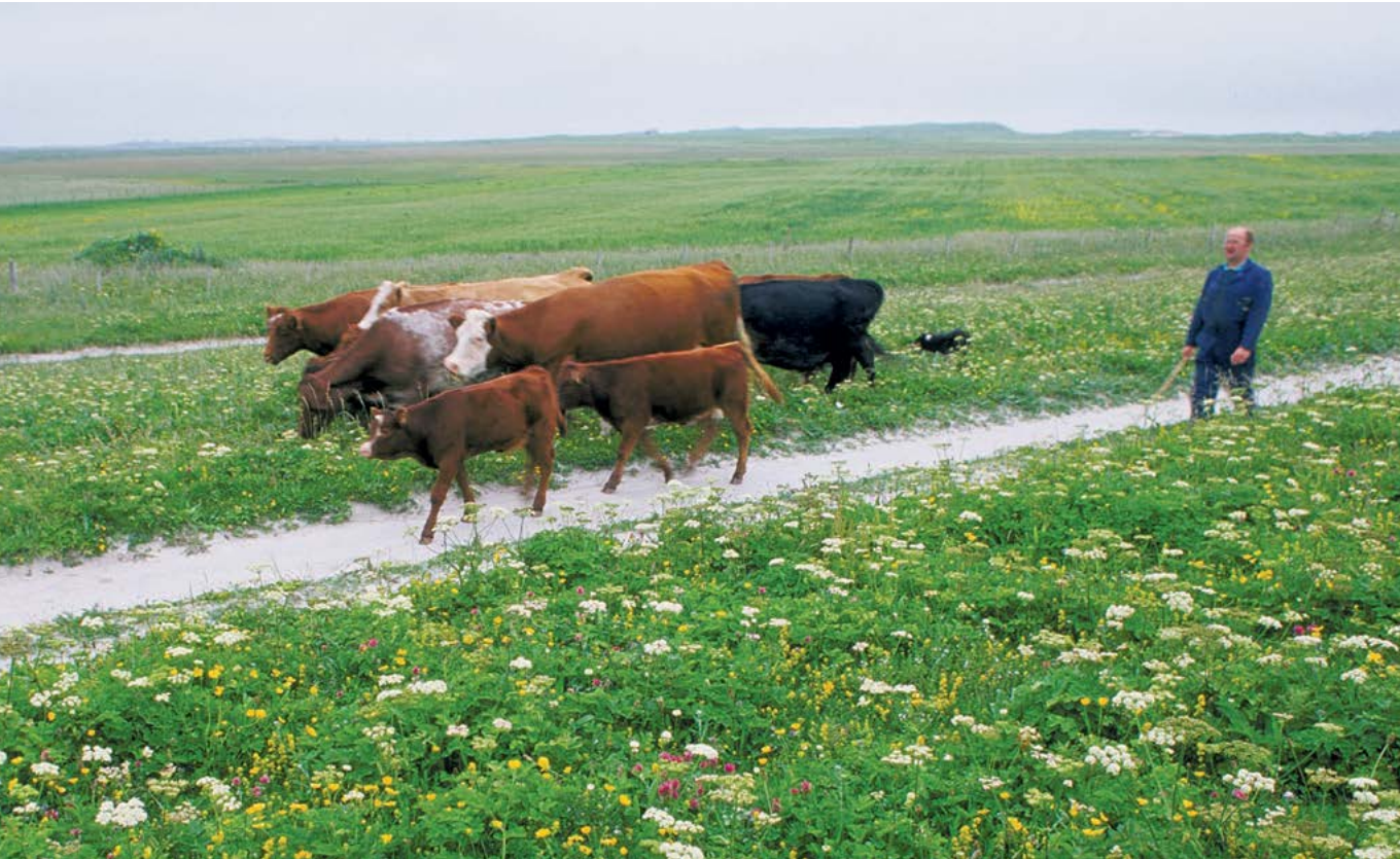
20 Crofter driving cattle through the machair, North Uist

Natura sites are part of a living landscape. Most of the sites which have been chosen have been subject to some form of use by humans for hundreds or thousands of years. Many of the sites reflect the influence of these activities, either now or in the past. People earn a living from farming, forestry and fishing in Natura sites, and many are enjoyed by visitors who appreciate their special qualities. In Scotland, SNH works with owners and occupiers of Natura sites to make sure they are managed sensitively and protected at the same time. However these sites are not intended to be 'no go' areas. In protecting Natura sites, we must allow for economic or social uses of the site which do not conflict with looking after its wildlife interest. We need to agree appropriate management by working with the land managers, local communities, regulating authorities, industries and the public who use the sites. Sources of funding are available to help with this process (see below).