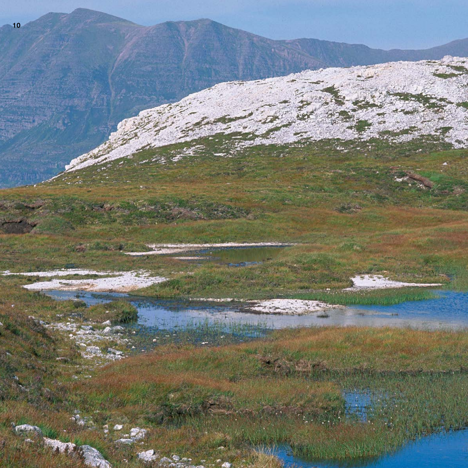
10 Beinn Eighe, Loch Maree Complex SAC 11 Dotterel