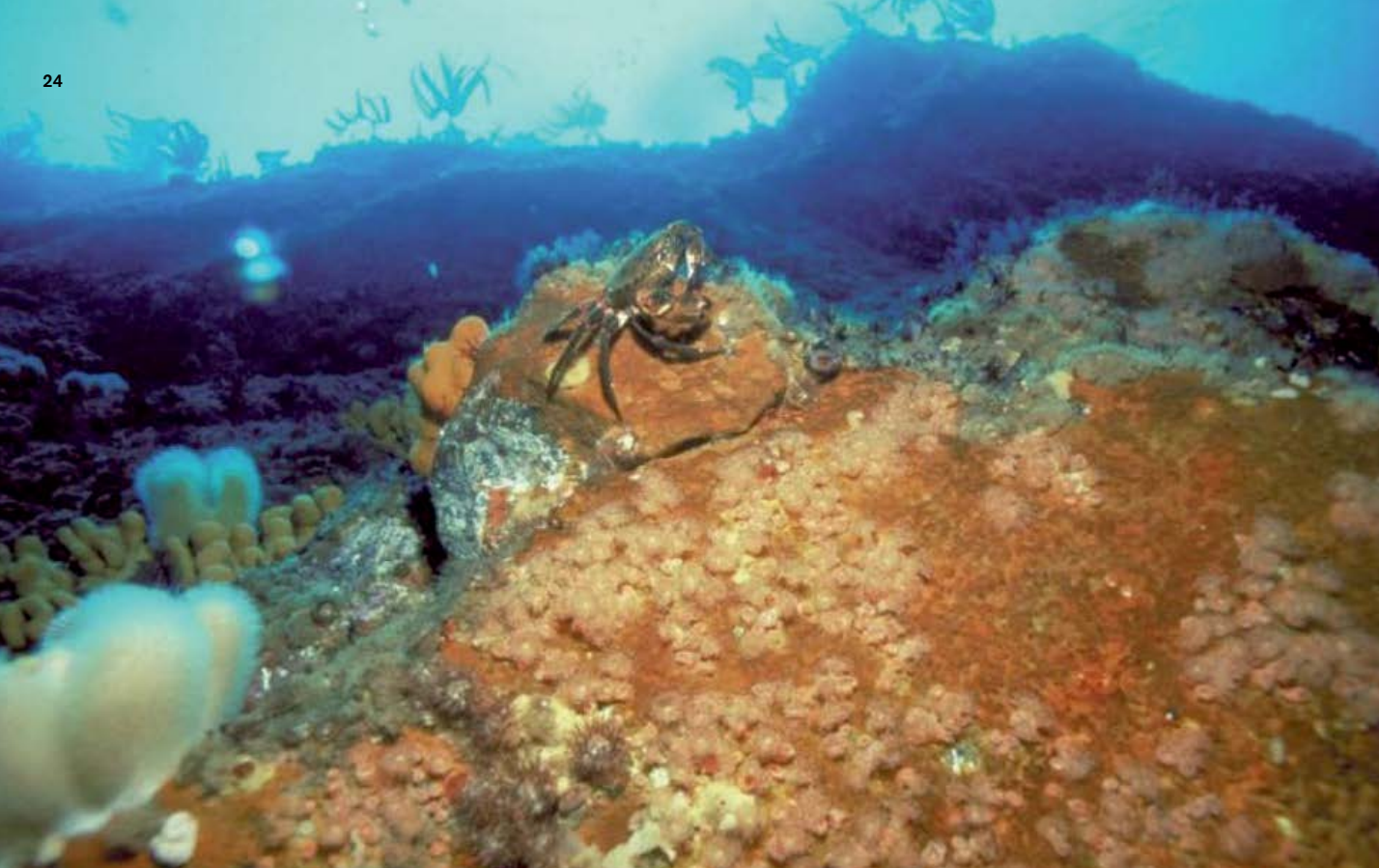
24 Underwater reef at St.Kilda