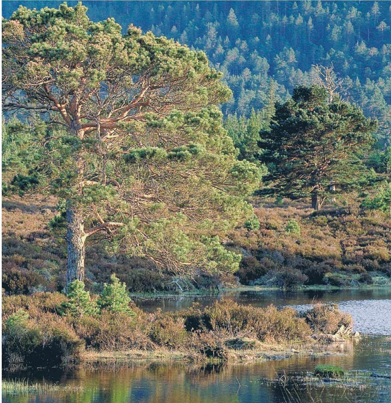
14 Caledonian forest, Rothiemurchus, Cairngorms 15 Twinflower – a rare pinewood plant