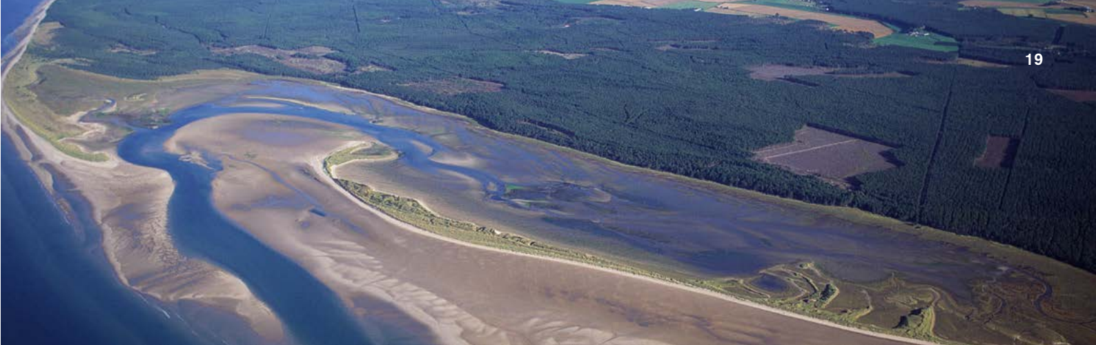
19 Culbin Bar SAC and Moray and Nairn Coast SPA

This map shows Natura sites in Scotland. It includes designated Special Areas of Conservation (SACs), classified Special Protection Areas (SPAs) and Sites of Community Importance (SCIs) (candidate SACs that have been adopted by the European Commission). Further information about a particular site, including candidate SACs and proposed SPAs, is available through SNH's SiteLink facility on the SNH website.