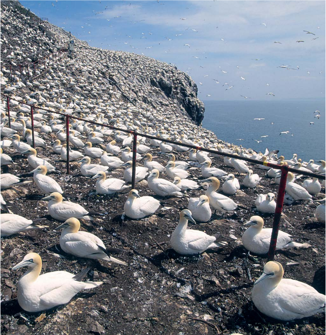
5 Noss SPA, Shetland 6 Gannet colony on the Bass Rock (part of Forth Islands SPA)

Rocky cliffs and islands also support noisy high-rise ‘cities’ of nesting seabirds; including over 40% of the world breeding population of gannets. These graceful seabirds, which hunt by plunge-diving, may travel hundreds of kilometres from their breeding colonies to feed far out in the North Sea or the Atlantic Ocean.