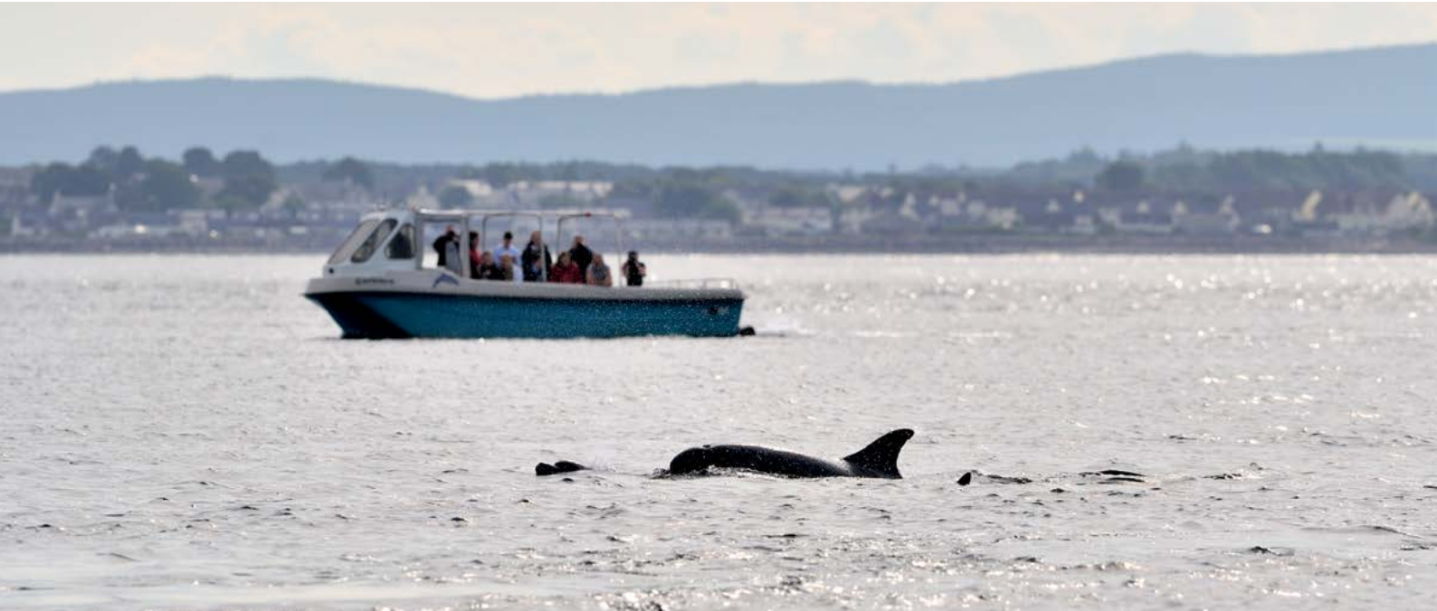
26 Bottlenose dolphins and a dolphin watching boat off Chanonry Point, Moray Firth SAC

Wildlife tourism is particularly important to rural communities where visitors can provide a valuable boost to local economies. The remarkable cliffs of St Abb’s Head, 60km east of Edinburgh, are home to thousands of breeding seabirds. Several thousand visitors come to watch this spectacle each year. There are also less accessible seabird breeding islands such as the Isle of May in the Firth of Forth (part of the Forth Islands SPA) and Handa SPA off the coast of Sutherland. These are tiny areas, but every summer each attracts many visitors to see the huge seabird colonies, providing important income to rural economies. While bird watching is most common, many other types of wildlife are watched, including dolphins, seals and otters. The Scottish Marine Wildlife Watching Code provides advice on how best to watch marine wildlife. It gives guidance on how to minimise disturbance and helps wildlife watchers stay within the law. Further information about wildlife law in Scotland is summarised in the leaflet ‘ Scotland’s Wildlife: The law and you ’.