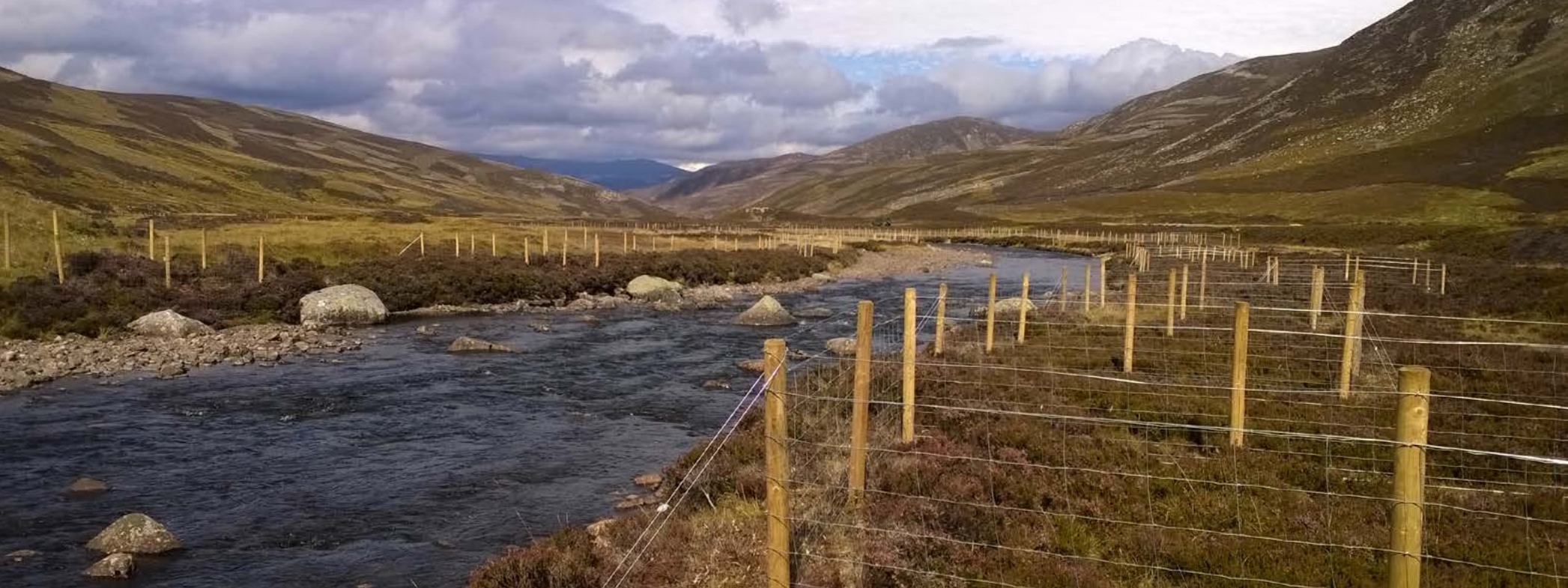
23 Small tree enclosures adjacent to SAC.