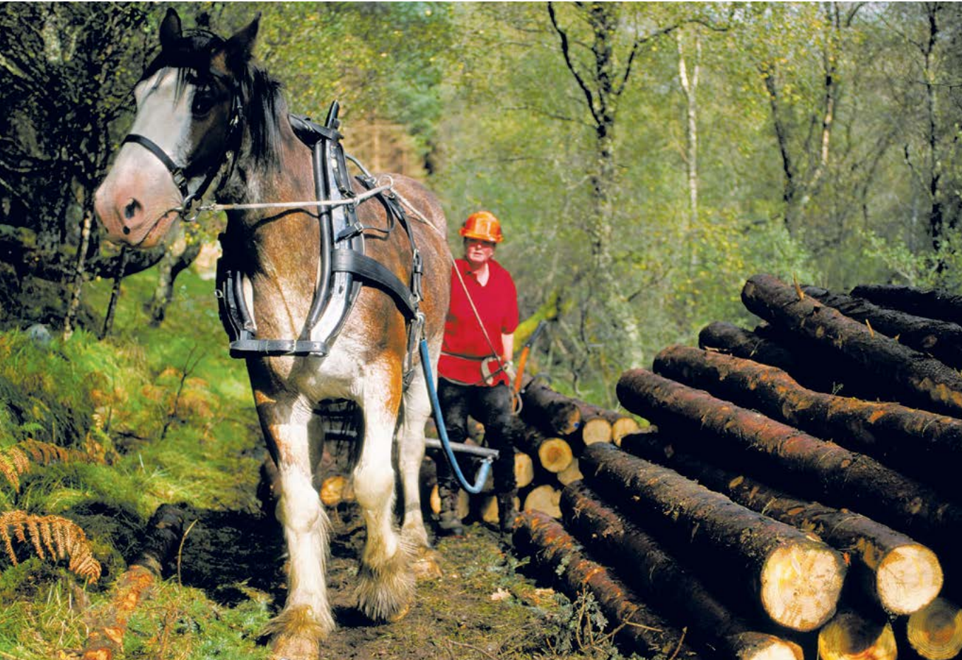
21 Extracting Sitka spruce by horse, Strontian